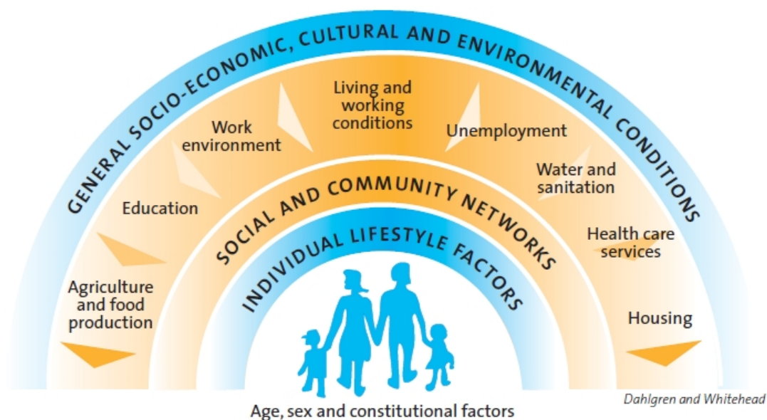
Figure 1 Social determinants of health 11